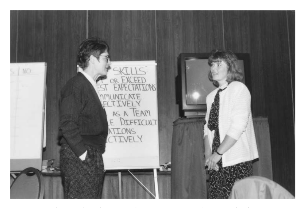
Figure 13-3. Planning the videotaping of a training session will assist in developing a unique aid.

An often overlooked but very effective practice is to allow front office employees to experience the services and products they sell. Familiarity with and appreciation for the chef's specials, the luxury of an upgraded room, the equipment in the health club, the new merchandise in the gift shop, and the personal assistance provided by the concierge enable the employee to promote these areas knowledgeably and enthusiastically.