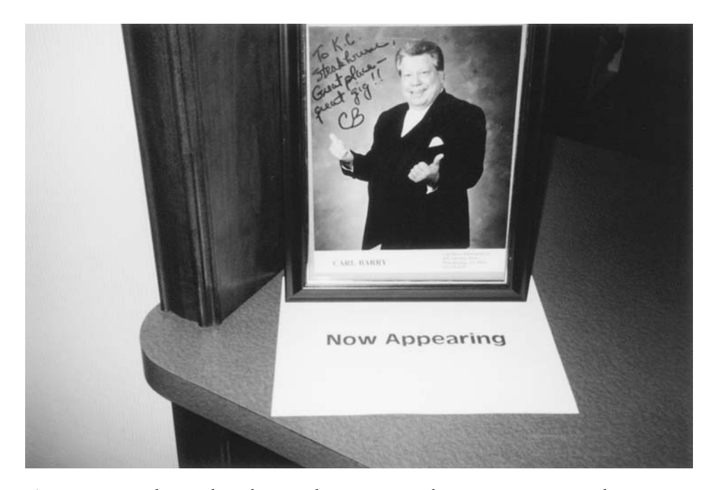
Figure 13-1. Displays such as this one alert guests to in-house entertainment.

office manager produced the room sales forecast yet?"; "Is there a block of rooms available for June 3-7?"; "To which rooms is this seminar group assigned?"; "Is there someone on duty who can greet and provide information for the tourist group that is arriving this afternoon?"; "Has the daily event board been set up in the lobby?"; or "Has the daily message been set on the great sign?" These are typical questions asked of the front office by other departments in the hotel. These tasks are a necessary part of any hotel's operations. However, today more than ever, hotel management demands more of the front office.